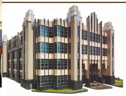
s i n g a p o r e g o d o w n b u i l d i n g