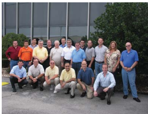
Ruhrpumpen North America Sales Meeting