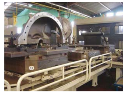
Pump shell in the manufacturing plant in Monterrey.

Ruhrpumpen, the specialist for centrifugal horizontal and vertical pumps, took charge of the fabrication of a cooling system to be used in the implementation of the Combined Cycle Plant of Guaracachi S.A. (EGSA) located in Santa Cruz de Las Sierras. Fabrication and testing of the pump took place at the Monterrey, Mexico plant, the pump will be sent to Santa Cruz for installation.