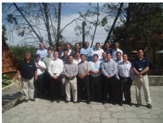
Ruhrpumpen Latin America Sales Meeting

Our sales teams come together on a regular basis to discuss market developments and new (and ongoing) projects. Recently the Latin America Sales meeting was held in Monterrey, Mexico. The North America Sales meeting was held in Tulsa, Oklahoma. With presentations on the market developments, areas of opportunity, and projects that Ruhrpumpen is supplying in various countries, a great deal of information was exchanged