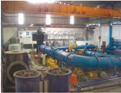
Test lab in Ruhrpumpen plant, Monterrey Mexico.